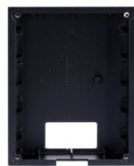
VTM114 (Flush mounted, Back)