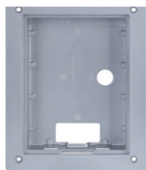
VTM114 (Flush mounted, Front)