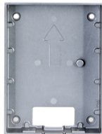
VTM115 (Surface mounted)